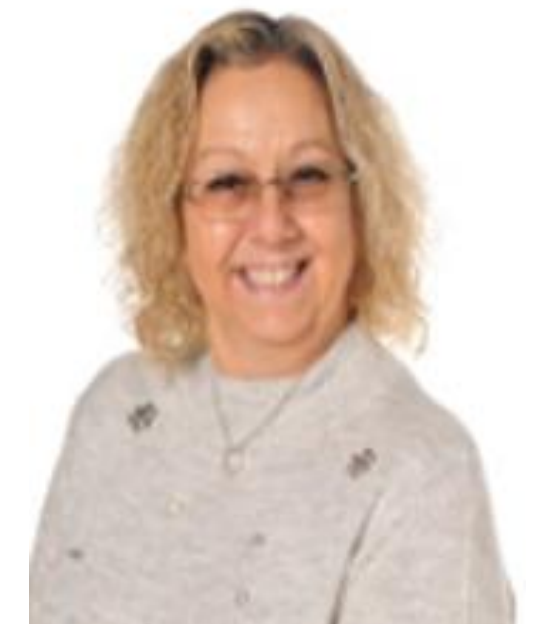
Sixth Form Administrator