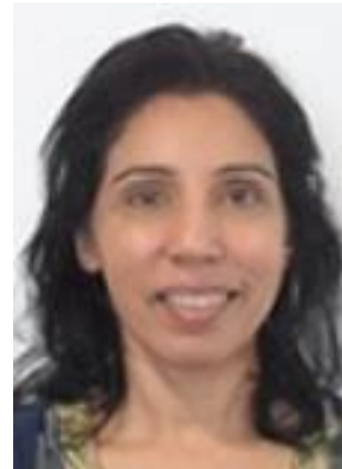
Deputy Year Leader