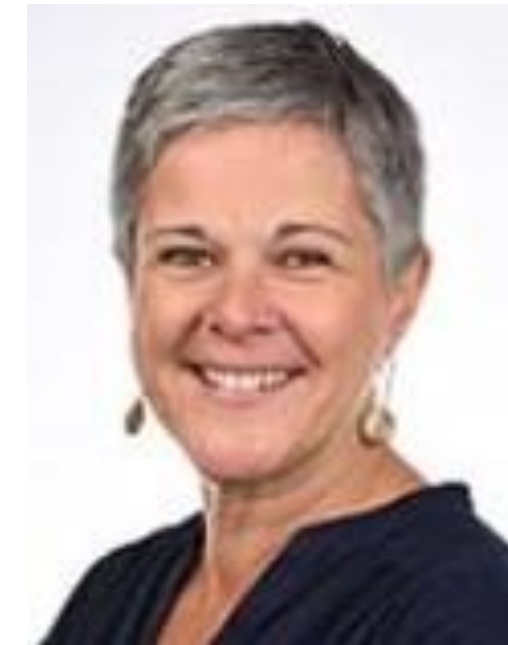
Raising Standards Champion