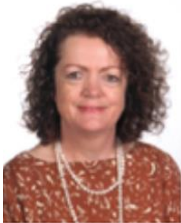
Head of Sixth Form