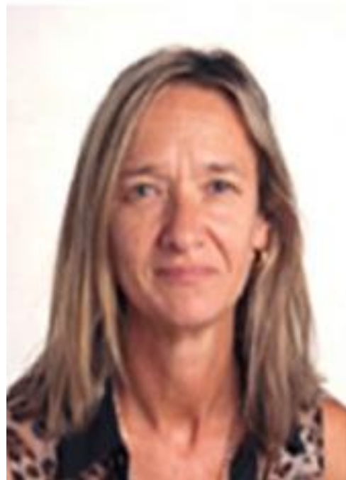
Year Leader 12/13